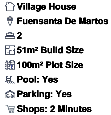
Charming 2-Bedroom Village House in Fuensanta de Martos